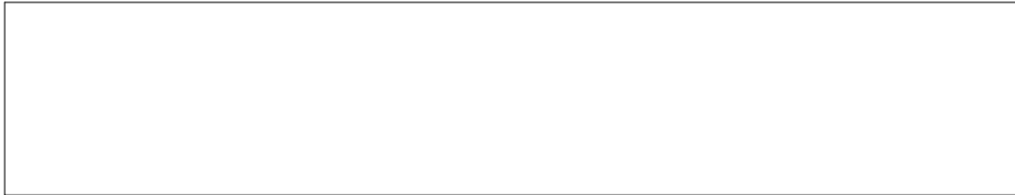
SCHEMATIC OF STACK CROSS SECTION

Plant _____ Run No. _____ Location _____ Ambient temperature _____ Operator _____ Barometric pressure _____ Date _____ Probe Length _____